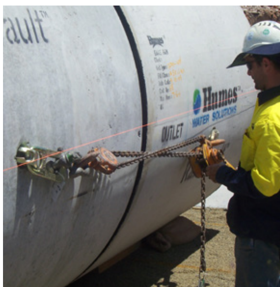
Top: First and second modules being joined by chain block