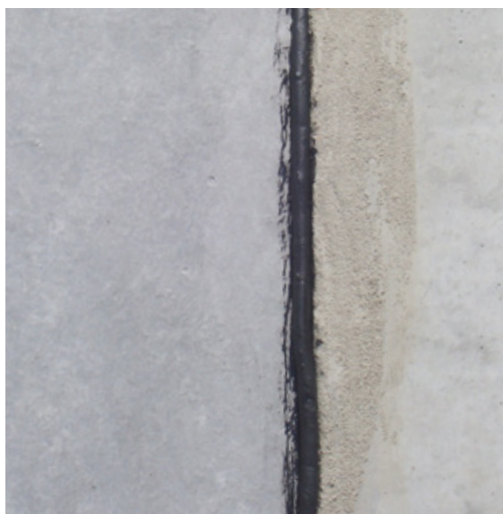
Bottom: Completed external joint less than 10mm wide. Note the mastic being squeezed out.